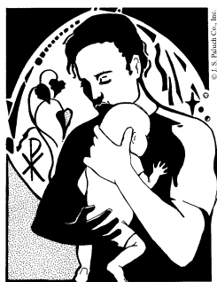
Happy Father's Day

FATHERHOOD - A father carries pictures where his money use to be..