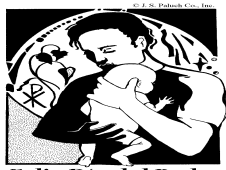
Feliz Día del Padre

CORRESPONSABILIDAD— JUNIO 20 “ En el evangelio de hoy, Jesús le pregunta a Pedro ¿Quién dices que soy yo?. ¿El uso de los talentos confiados a mi, reflejan mi contestación a la misma pregunta? ¿Que dispuesto estoy a darme, tomar mi cruz y seguir su pasos